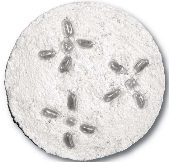
Blue and green glass stones adorn this gorgeous garden stepping stone. Others like this are available for purchase at Studio SPARK.

You can see and buy a variety of works including paintings on canvas, unique garden stepping stones, handmade pressed-flower notecards, brightly-painted gourd-shaped bird houses, and so much more.